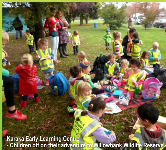
Karaka Early Learning Centre - Children off on their adventure to Willowbank Wildlife Reserve

Community & Public Health 18 Woollcombe Street P O Box 510, TIMARU Phone: 03 687 2600 | Fax: 03 688 6091 www.wavesouthcanterbury.co.nz