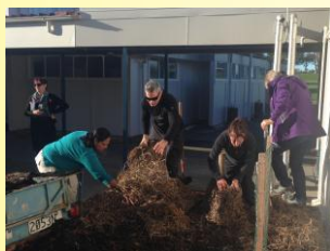
Creating Timaru Christian Schools no dig garden at the recent WAVE Gardening Workshop