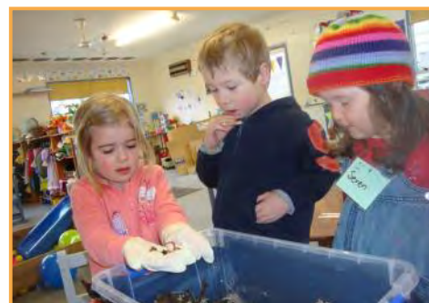
Pleasant Point Playcentre