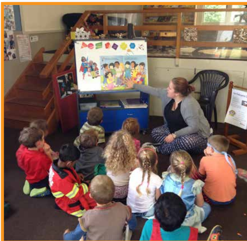
John Street Kindergarten