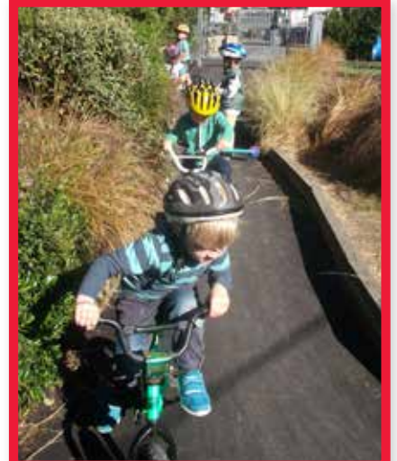
John Street Kindergarten