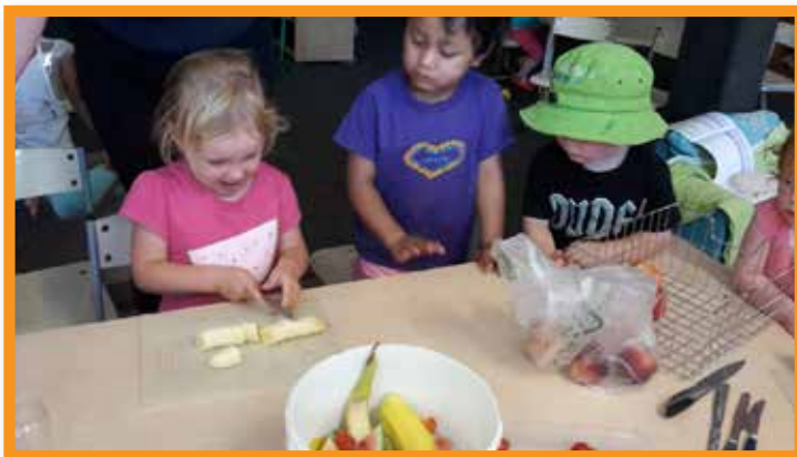
Active Learners Early Childhood Centre