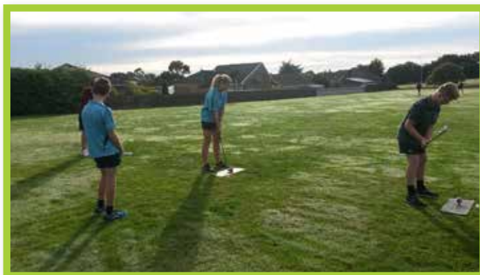
Have A Go Day, 31 March – golf