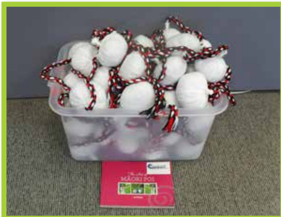
Class Set of Poi, R013563 - Develop your Poi skills! This set contains 28 pairs of Poi and a book (The Art of Poi) which outlines the history of Poi, how to make Poi, Poi games, Poi actions and Poi Waiata