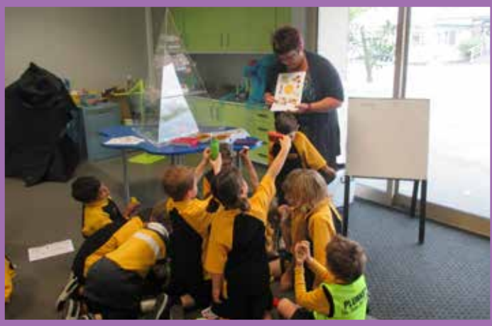
Students using the 3D food pyramid. Here they learnt about 'everyday', 'sometimes' and 'occasional' foods with each student getting to put the food models into the food pyramid where they thought they should go

Waimataitai School used the WAVE healthy eating resources as part of their healthy eating unit in Term 1. Six classrooms from new entrance to Year 2 used these interactive resources to learn more about healthy choices and the four food groups – everyday foods that are recommended for good health.