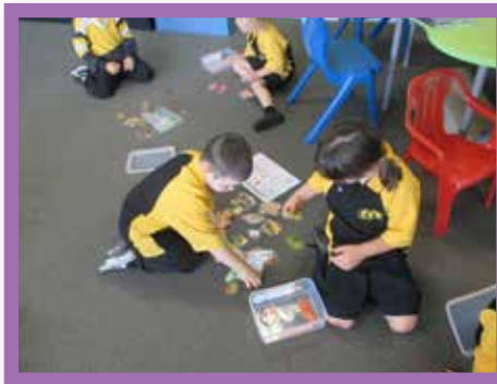
Students build a healthy lunchbox on this interactive Ka Pai Kai lunchbox display

Each of these resources have lesson plan ideas with them.