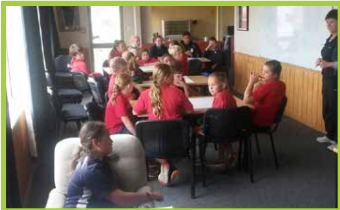
PALs Day, 22 March – planning session

A record 136 physical activity leaders (PALS) gathered at the Southern Trust Events Centre for a day of sport leadership and learning. This annual event promotes the development of leadership in school through physical activity. A second workshop for these great young leaders will be offered in June.