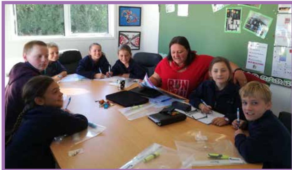
Glenavy's Student Health Team hard at work organising their Term 1 event – a healthy lunch for students and their whānau