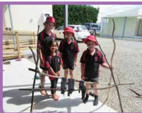
Tamariki with their traditional Māori fishing racks which they built