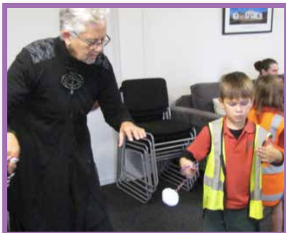
Barton Rural junior students enjoying their first attempt at learning poi during their recent visit to the Waihao Marae