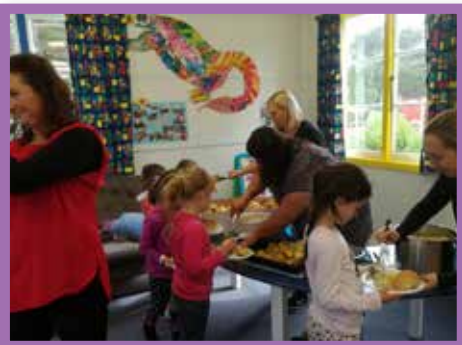
Glenavy School held a healthy lunch which was jointly prepared by the Student Health Team and staff. The students and whānau all enjoyed baked potatoes, coleslaw, rice and veggies with fruit kebabs afterwards