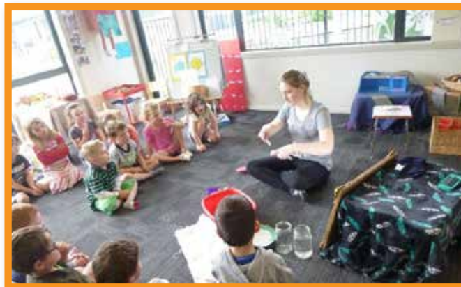
Rural Scholars Early Learning Centre