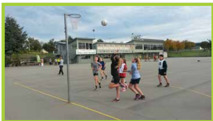
Have A Go Day, 31 March – netball

Sport Canterbury was pleased to facilitate a 'Have a Go' day for Year 7 and 8 students in late March. Eight schools with 178 participants got to experience seven different sports across a day of learning and fun. Many children were exposed to new sports for the first time in a fun environment; touch, golf, inline skating and lawn bowls were just some of the activities available. Sports had the chance to showcase their sport to new students and it was great to see many smiling faces.