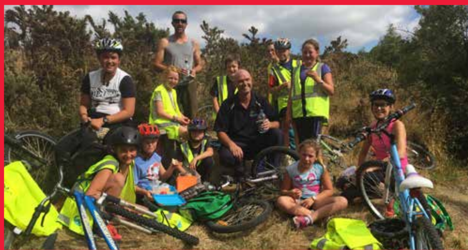
Cannington Primary School