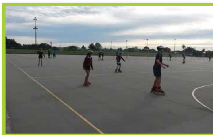
Have A Go Day, 31 March – inline skating