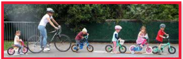
ESK Valley Kindergarten