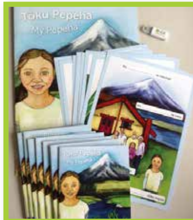
Tōku Pepeha/My Pepeha, R013556 - Tōku Pepeha is a story about Rīpeka and her pepeha. You can adapt this story to fit your local region/kawa. It works as a model for other children to introduce themselves in a similar way. Set contains: a big bilingual book, 9 small bilingual books and 10 flash cards