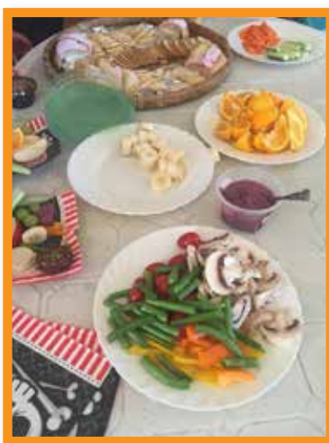
Childsplay 2015 Ltd