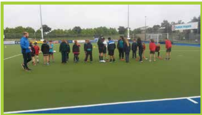
PALs Day, 22 March – football