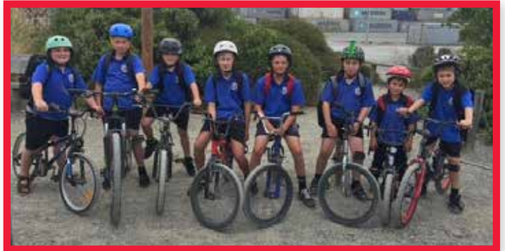
Timaru South Primary School