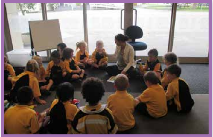
One teacher helps her students decide where the food items go in the food pyramid