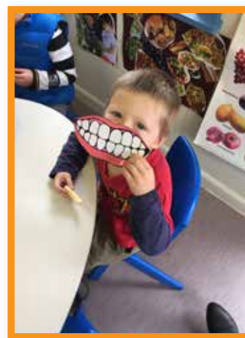
Home Grown Kids Timaru