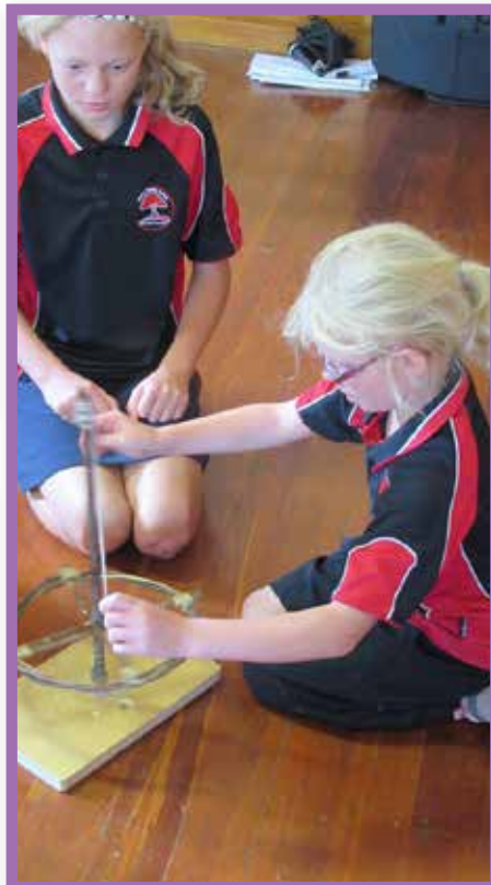
Tamariki learning to build traditional Māori tools

Keep encouraging your community to like the WAVE South Canterbury Facebook page for regular updates, competitions, links and other useful information.