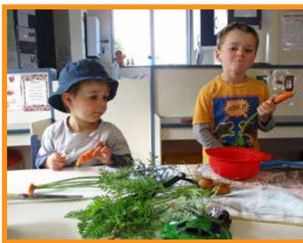
Pleasant Point Playcentre